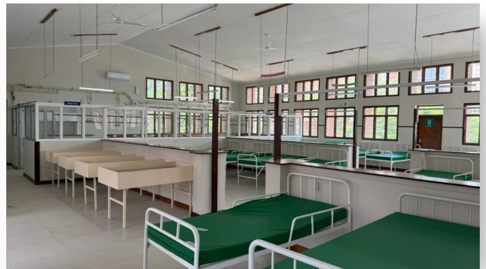
Part of the Ward