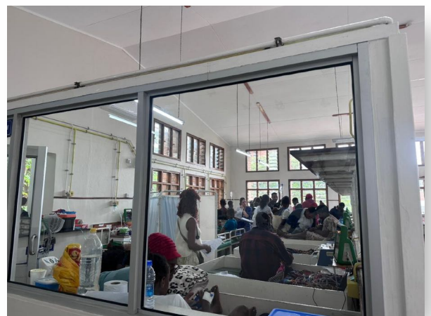
HDU section back in action