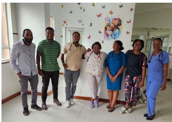
Registrar team ready for action